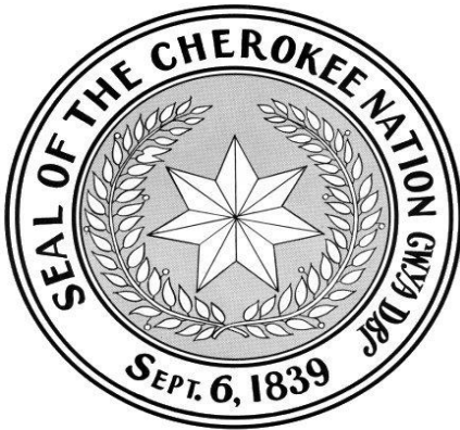
SEAL OF THE CHEROKEE NATION

Our mission is to provide life-enhancing home and community-based health services with pride, compassion, and integrity to those in need.