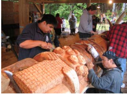
“Woocheen” working together.

Tlingit-Haida Regional Housing Authority’s primary mission is to provide affordable housing throughout southeast Alaska. Understanding the need for senior services, Tlingit-Haida Regional Housing Authority has partnered with Southeast Senior Services in Klawock, Alaska to provide elderly services to senior residents. Southeast Senior Services works throughout southeast Alaska and is a recognized senior service provider through their multiple programs. The collaborative effort between Southeast Senior Services and Tlingit-Haida Regional Housing Authority has resulted in each organization working together to do what they do best! Each organization brings their expertise and works together through a senior service coordinator as liaison to deliver services to the community. For more information on Tlingit Haida Regional Housing Authority visit