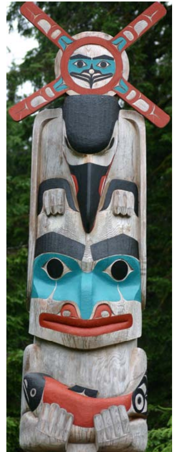
In memory of Nathan Bremner

see next page for continuation of Yakutat’s success